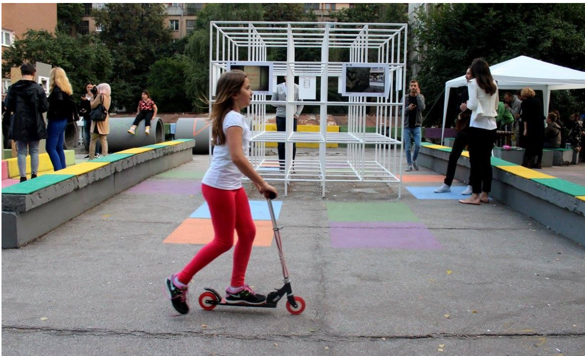
Figure 4: Child playing in Grbavica park.