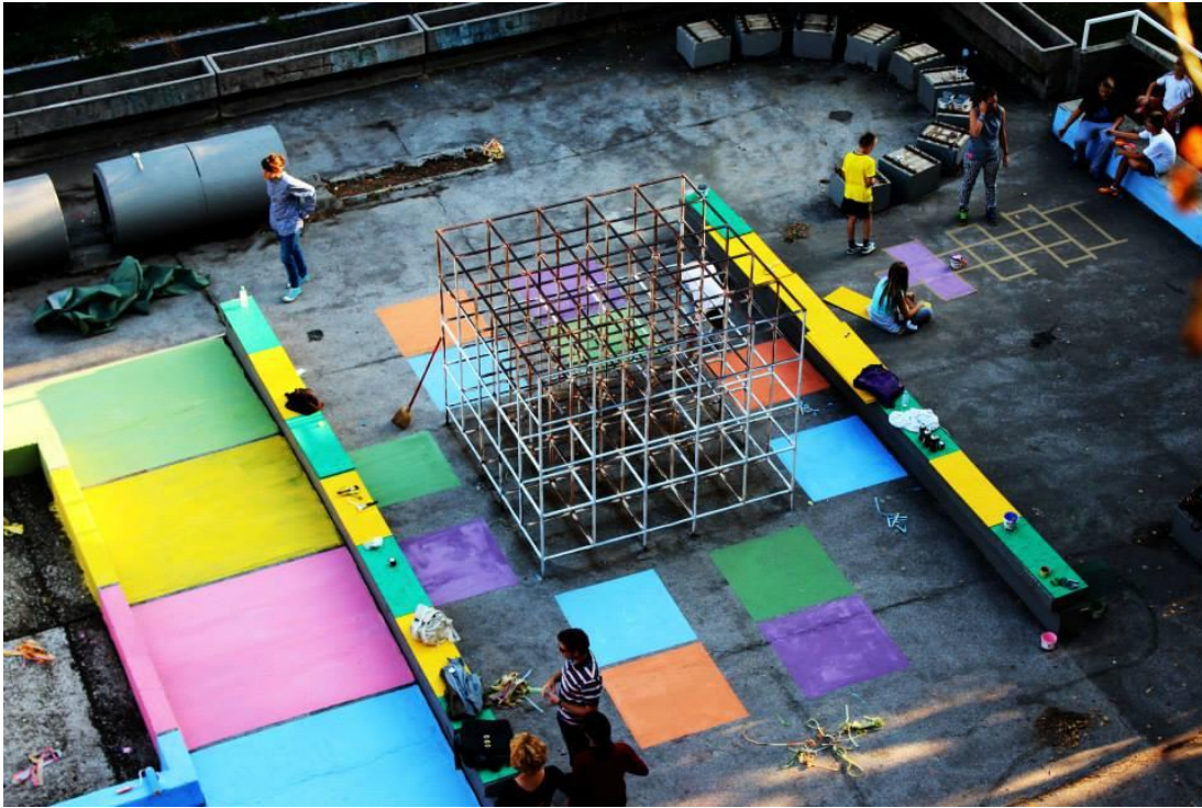
Figure 5: General oversight of the first Dobre Kote project.