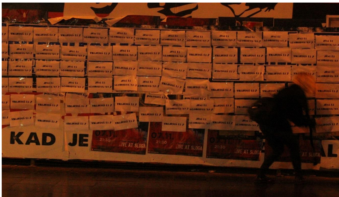
Figure 1 and 2: Street actions in Sarajevo.