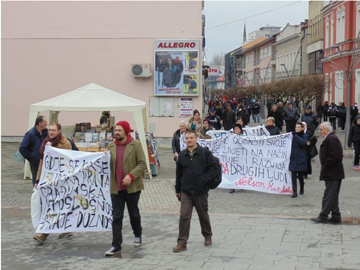
Figure 3: Street action in Stolac on Human Right's Day.