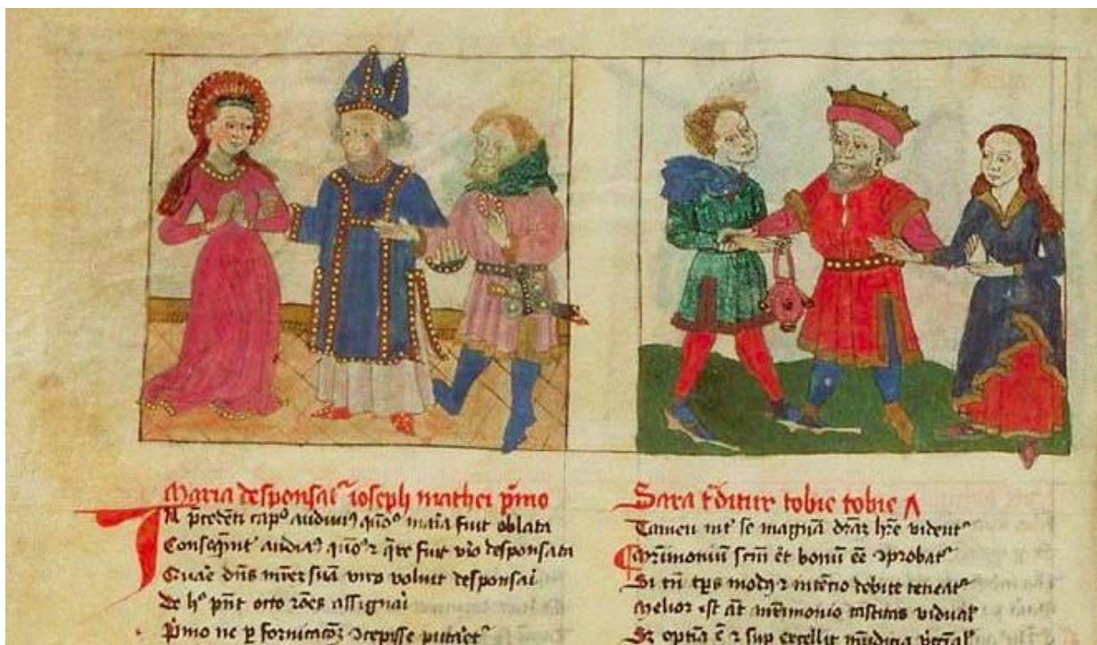
Fig. 8. Miniature depicting the marriage of Maria and Joseph and another miniature depicting the wedding of Tobias and Sarah (f. 6v), c. 1450. Paint and ink on vellum, 295 x 210 mm (Full page). The Hague, RMMW, 10 B 34. Available from: Medieval Illuminated Manuscripts, http://manuscripts.kb.nl/zoom/BYVANCKB%3Amimi_mmw_10b34%3A006v (accessed May 30, 2018).