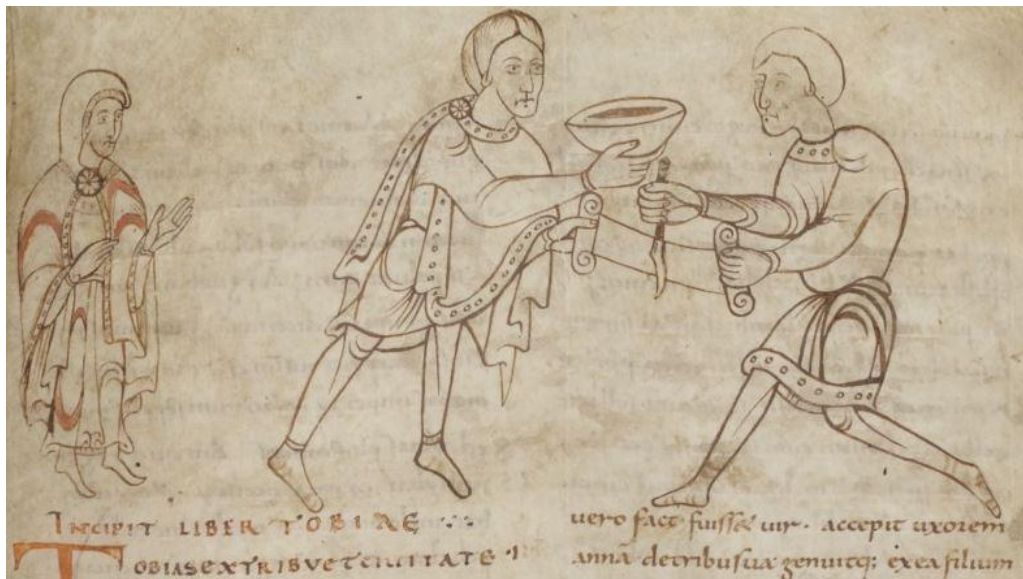
Fig. 2. Miniature depicting Tobit and Gabael sealing their contract (f. 18r), 10 th century. Ink on parchment, 340 × 260 mm (Full page). Paris, Bibliothèque nationale de France, MS. Lat. 94. Available from: Gallica, http://gallica.bnf.fr/ark:/12148/btv1b84260363/f43.image (accessed May 30, 2018).