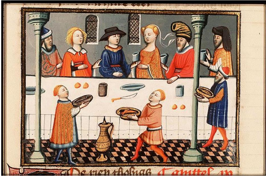
Fig. 28. Miniature depicting the wedding feast of Sarah and Tobias (f. 239r), c. 1430. Paint and ink on vellum, 398 x 300 mm (Full page). The Hague, Koninklijke Bibliotheek, 78 D 38 I.