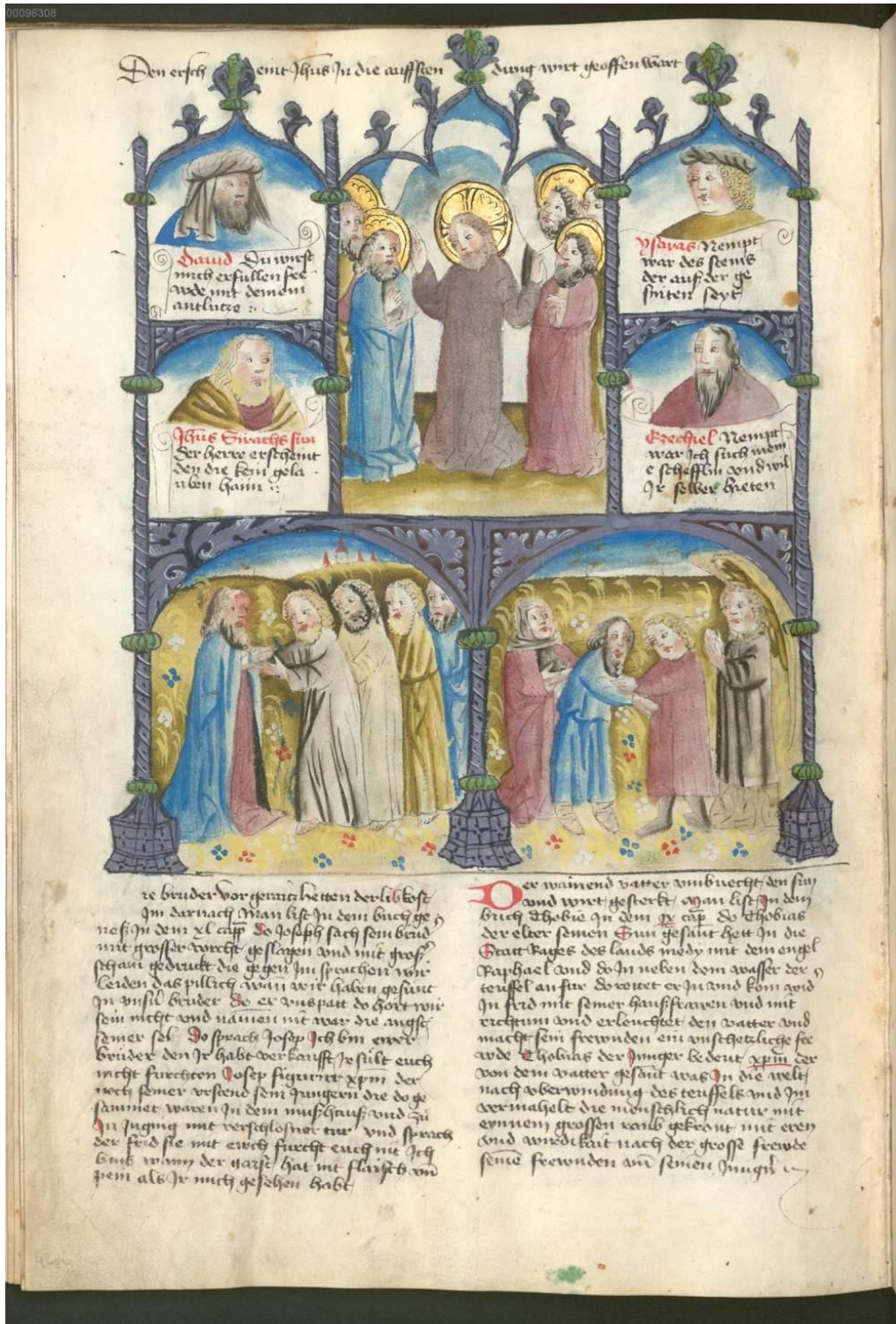
Fig. 6. Manuscript folio depicting four prophets and Christ on the road to Emmaus prefigured by Isaac receiving Jacob's blessing and Tobias greeted by Raguel (f. 21r), c. 1450. Paint and ink on parchment, 399 x 275 mm. Munich, Bavarian State Library, Cgm 155.