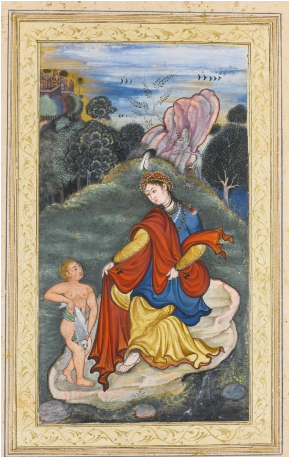
Fig. 50. Keshav Das, A lady with the young Tobias in a landscape , c. 1575-80. Gouache heightened with gold on cotton, mounted on paper, 216 x 119 mm (Painting). Provenance unknown. Available from: Sotheby's, http://www.sothebys.com/en/auctions/ecatalogue/2015/sven-gahlin-collection-115224/lot.3.html (accessed May 30, 2018).