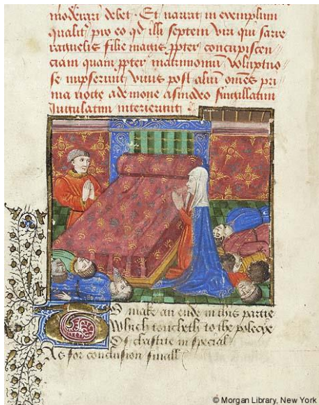
Fig. 40. Miniature showing Tobias and Sarah praying during their wedding night, c. 1470. Paint and ink on vellum, 440 x 320 mm (Full page). New York, The Pierpont Morgan Library, MS. M 126. Available from: The Morgan Library and Museum, http://ica.themorgan.org/manuscript/page/82/77039 (accessed May 30, 2018).