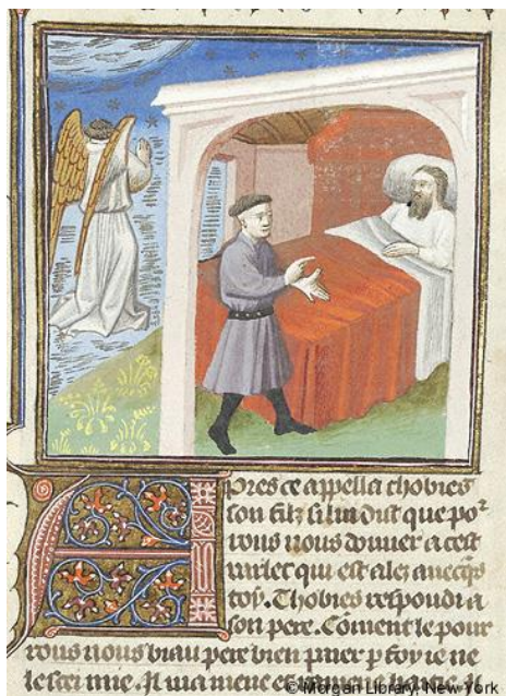
Fig. 23. Miniature showing that the angel Raphael revealed his identity (f. 190r), c. 1415. Paint and ink on vellum, 444 x 352 mm (Full page). New York, Pierpont Morgan Library, MS. M. 394.