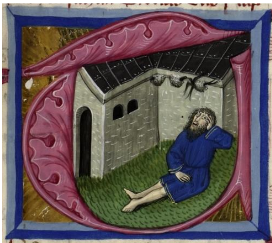
Fig. 13. Historiated initial depicting Tobit's blinding (f. 137r), 1465. Paint on parchment, 375 x 275 mm (Full page). London, The British Library, Egerton 1895.