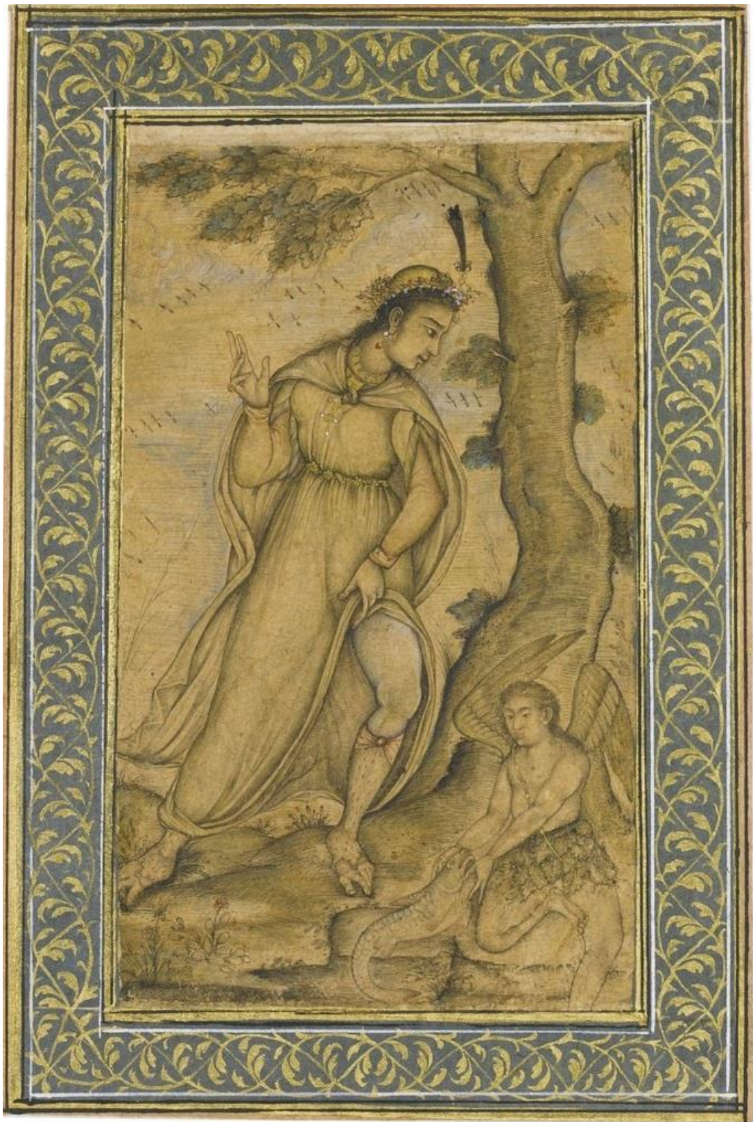
Fig. 48. Manohar, Tobias and the Angel , c. 1610. Brush and ink heightened with gold and color on paper, 110 x 65 mm (Drawing). Provenance unknown. Available from: Sotheby's, http://www.sothebys.com/en/auctions/ecatalogue/2015/sven-gahlin-collection-115224/lot.19.html (accessed May 30, 2018).