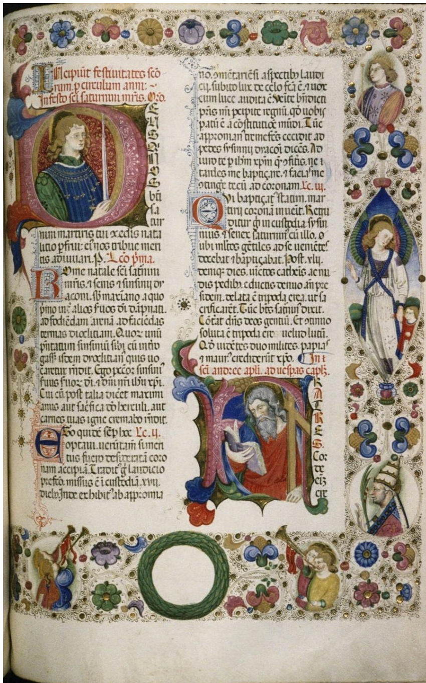
Fig. 31. Title page to the Sanctorale with depictions of St. Saturninus and St. Andrew and in the decorated border Tobias and the angel, the pope, a king and angels blowing trumpets (f. 267r), c. 1475. Paint and ink on parchment, 390 x 260 mm. Oxford, Bodleian Library, MS. Canon. Liturg. 388. Available from: Luna, http://bodley30.bodley.ox.ac.uk:8180/luna/servlet/detail/ODLodl~1~1~37069~105953:Augustinian-Breviary--Use-of-Rome-?sort=Shelfmark%2CFolio_Page%2CRoll_%23%2CFrame_%23&qvq=q:tobias;sort=Shelfmark%2CFolio_Page%2CRoll_%23%2CFrame_%23;lc:ODLodl~1~1&mi=11&trs=20# (accessed May 30, 2018).