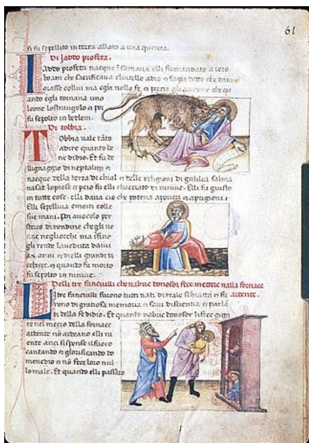
Fig. 41. Folio showing three miniatures with Iaddo, Tobit, and Nebuchadnezzar (f. 61r), 1425. Paint and ink on parchment, 245 x 110 mm. London, British Library, Yates Thompson 28 ( Il Tesoro ).