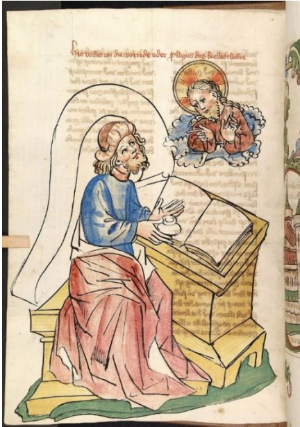
Fig. 20. Folio showing Tobit as a scribe (f. 56v), c. 1445. Paint and ink on paper, 405 x 292 mm. Heidelberg, Universität Heidelberg, Cod. Pal. Germ. 21.