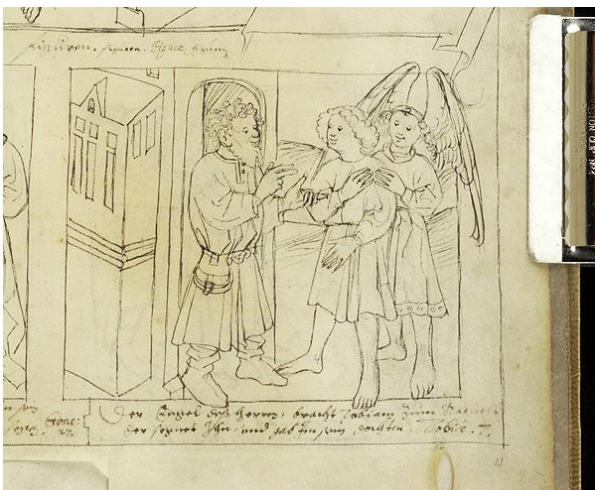
Fig. 5. Miniature depicting Raguel welcoming Tobias and the angel (f. 21r), c. 1435. Ink on vellum, 387 x 285 mm (Full page). New York, The Morgan Library & Museum, MS M.230. Available from: The Morgan Library and Museum, http://ica.themorgan.org/manuscript/page/41/77199 (accessed May 30, 2018).