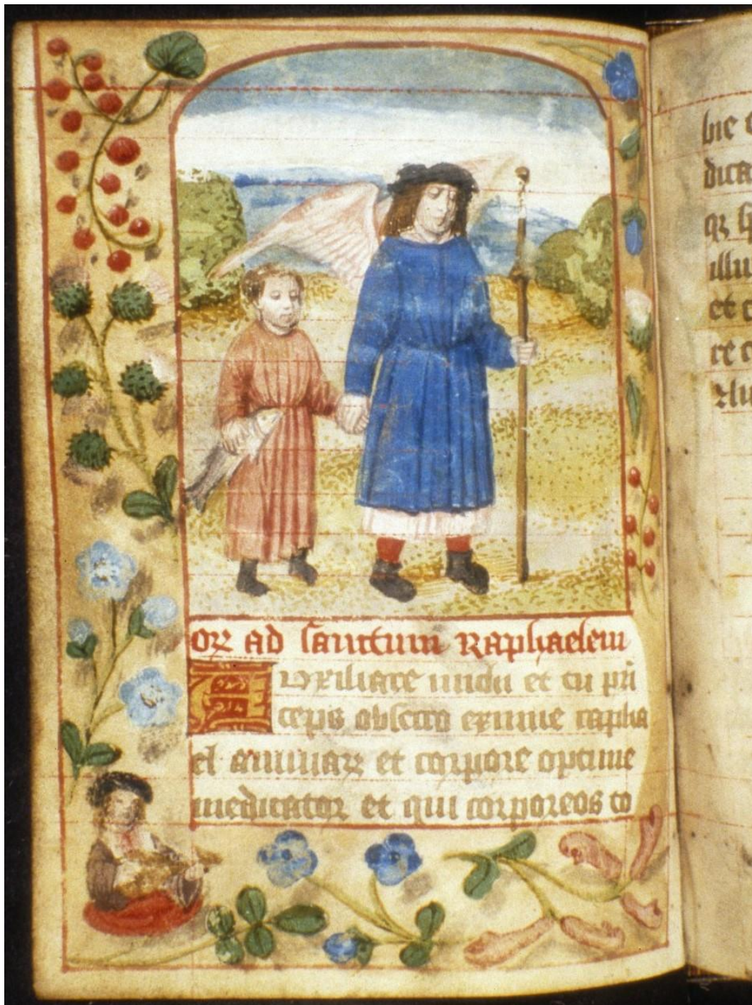
Fig. 35. Folio with a miniature depicting Tobias and the angel on their way, with a decorated border, c. 1500. Paint and ink on parchment, 105 x 78 mm. Oxford Bodleian Library, MS.

Lat. Liturg. g. 5. Available from: Luna,