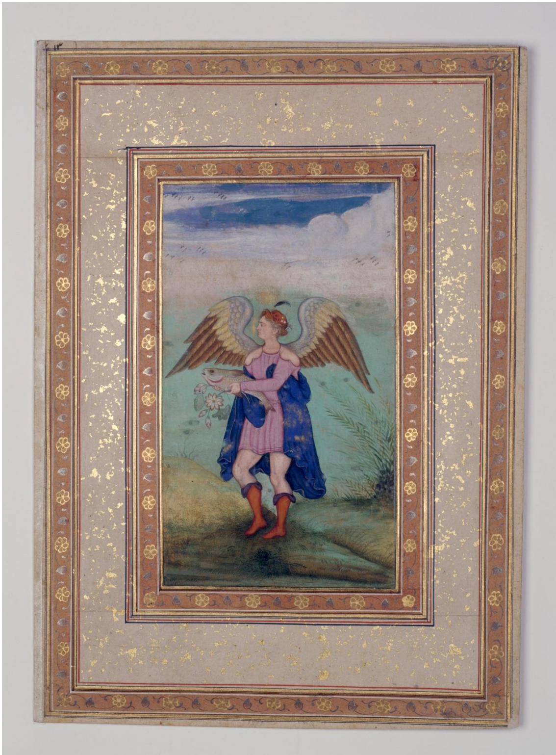
Fig. 1. Angel with a fish (f. 36r), beginning of the 17 th century. Material and dimensions unknown. Berlin, Staatliche Museen zu Berlin, part of the Polier albums, Inv.-Nr. 4601. Martina Müller-Wiener, Email to author, May 30, 2018.