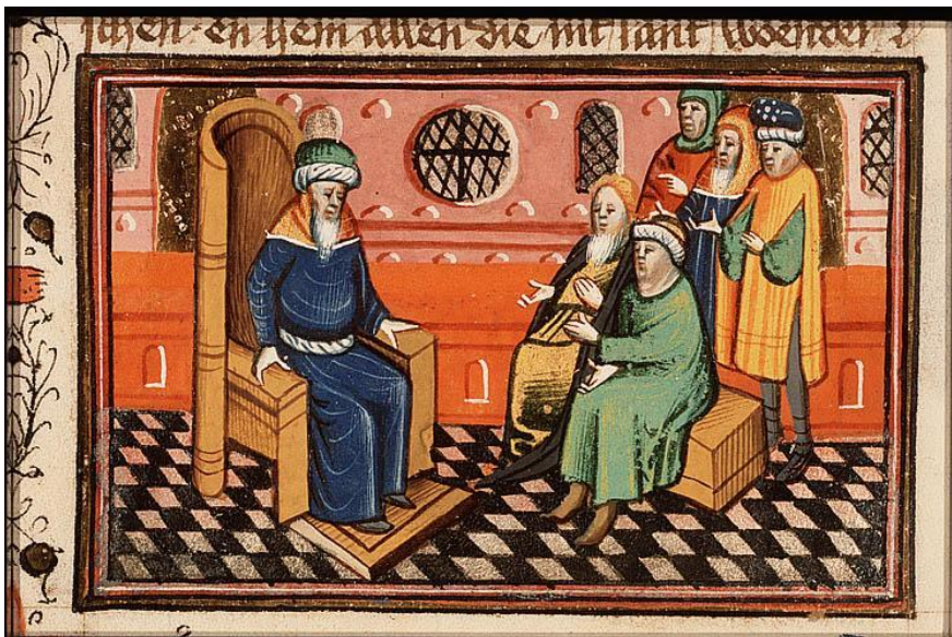
Fig. 29. Miniature showing Tobit giving his last admonitions to a group of five men (f. 240v), c. 1430. Paint and ink on vellum, 398 x 300 mm (Full page). The Hague, Koninklijke Bibliotheek, 78 D 38 I.