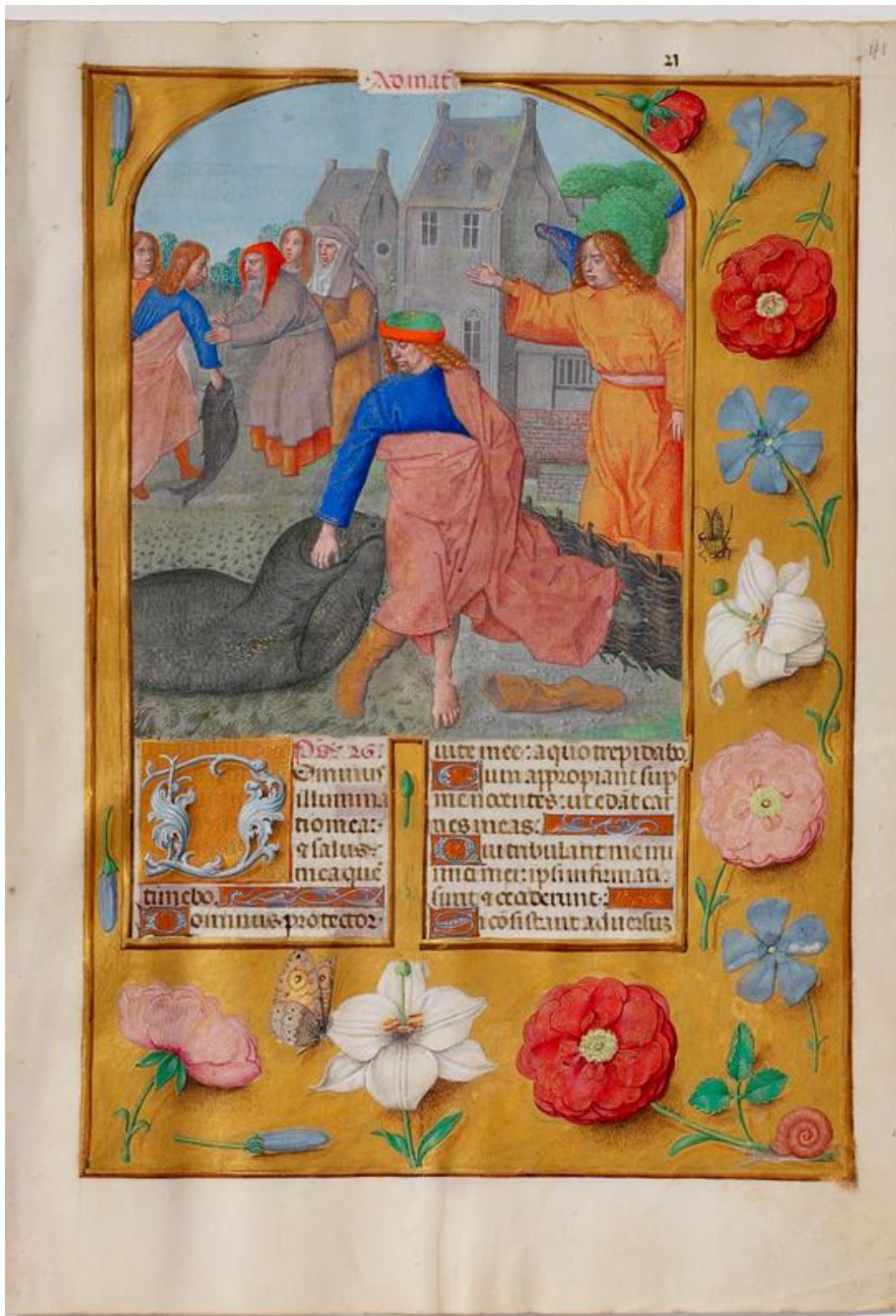
Fig. 32. Folio showing two scenes of the Book of Tobit in one miniature, with a decorated border (f. 41r), c. 1505. Paint and ink on parchment, 224 x 160 mm. Antwerp, Museum Mayer van den Bergh, Obj.-Nr. 90563.