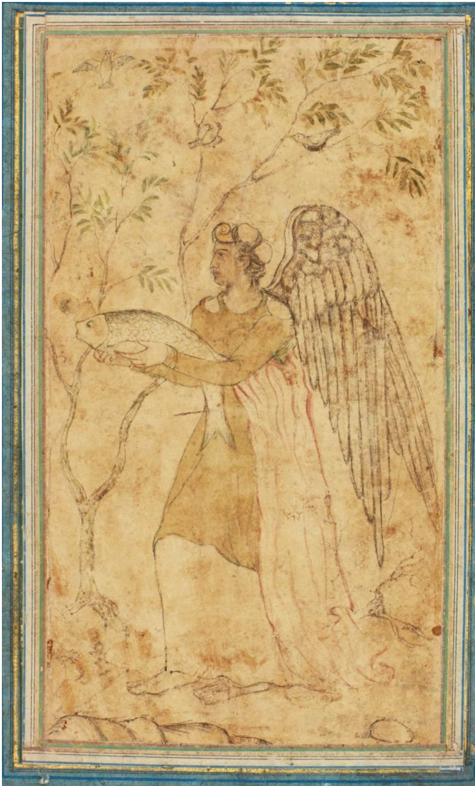
Fig. 43. An angel holding a fish , c. 1590-1600. Ink with use of colors and gold on paper, 148 x 83 mm (Drawing). Provenance unknown. Available from: Sotheby's, http://www.sothebys.com/en/auctions/ecatalogue/2016/arts-islamic-world-116220/lot.44.html (accessed May 30, 2018).