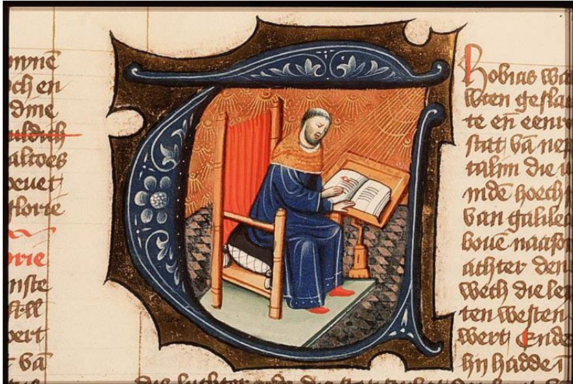
Fig. 16. Historiated initial with Tobit sitting and reading at a desk (236r), c. 1430. Paint and ink on vellum, 398 x 300 mm (Full page). The Hague, Koninklijke Bibliotheek, 78 D 38 I.