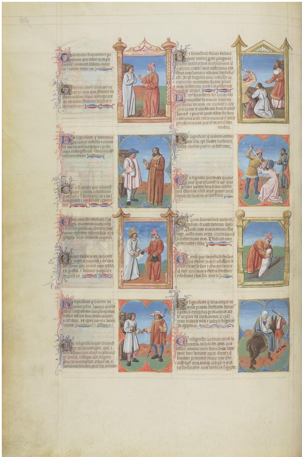
Fig. 11. Folio of a Bible moralisée on which Tobit serves as a prefiguration of Christ, the episode in which Tobit deposits money with Gabael serves as a prefiguration for the parable of the ten talents and on which king Sennacherib serves as a prefiguration for Herod (f. 94v), 15 th century. Paint and ink on vellum, dimensions unknown. Paris, Bibliothèque nationale de France, MS Français 166. Available from: Gallica, http://gallica.bnf.fr/ark:/12148/btv1b105325870/f202.image (accessed May 30, 2018).