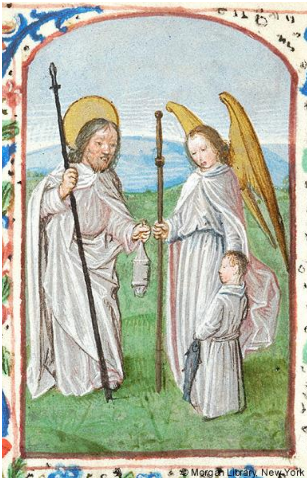
Fig. 36. Miniature depicting Tobias and the angel meeting Raguel(?) (f. 189v), c. 1475. Paint and ink on vellum, 67 x 49 mm (Full page). New York, The Pierpont Morgan Library, MS M. 1077.