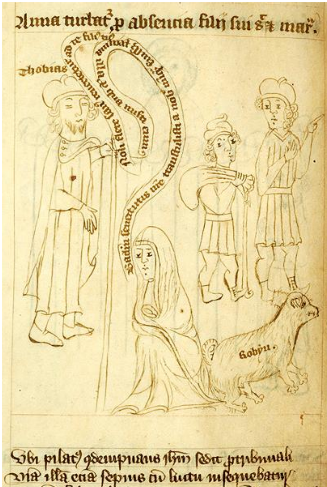
Fig. 9. Detail of a miniature depicting the mourning Tobit and Anna and Tobias and the angel on their way (f. 56v), c. 1400. Ink on vellum, 330 x 240 mm (Full page). New York, The Morgan Library & Museum, MS M. 766. Available from: The Morgan Library and Museum, http://ica.themorgan.org/manuscript/page/69/131050 (accessed May 30, 2018).