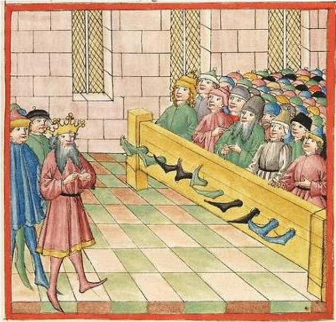
Fig. 26. Miniature depicting the are the captivity of Tobit in Nineveh (233r), 1477. Paint and ink on paper, 396 x 273 mm (Full page). Heidelberg, Universitätsbibliothek, Cod. Pal. Germ. 17. Available from: Universitätsbibliothek Heidelberg, http://digi.ub.uni-heidelberg.de/diglit/cpg17/0473/image (accessed May 30, 2018).