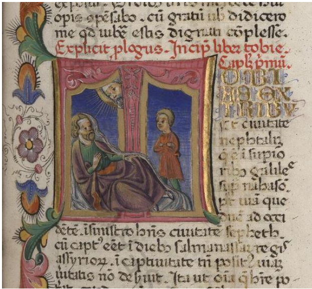
Fig. 14. Historiated initial depicting Tobit laying down, with his son Tobias standing next to him and God appearing from behind the stem of the letter T (Folio 209r), 1454. Paint and ink on parchment, 372 x 260 mm (Full page). Vatican, Biblioteca Apostolica Vaticana, Vat. Lat. 1. Available from: Digital Vatican Library, https://digi.vatlib.it/view/MSS_Vat.lat.1 (accessed May 30, 2018).