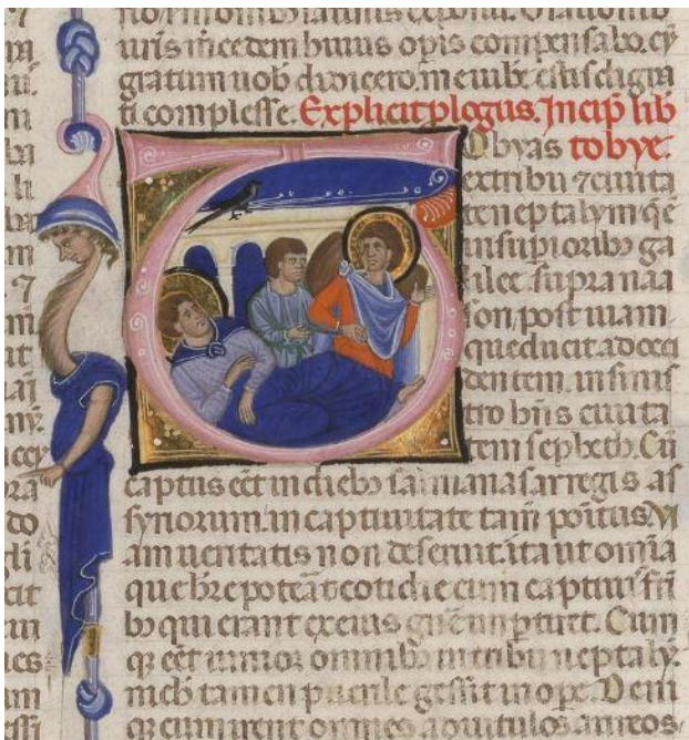
Fig. 15. Historiated initial with Tobit laying down while Tobias and the angel stand next to him (149r), first half of the 15 th century. Ink and paint on parchment, 434 x 280 mm (Full page). Vatican, Biblioteca Apostolica Vaticana, Vat. Lat. 20. Available from: Digital Vatican Library, https://digi.vatlib.it/view/MSS_Vat.lat.20 (accessed May 30, 2018).