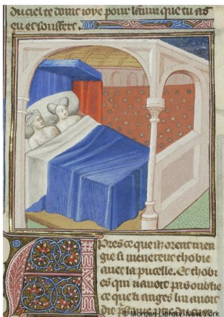
Fig. 25. Miniature showing Tobias and Sarah in bed (f. 3v), c. 1415. Paint and ink on vellum, 444 x 330 mm (Full page). New York, The Pierpont Morgan Library, MS M. 395. Available from: The Morgan Library and Museum, http://ica.themorgan.org/manuscript/page/6/110798 (accessed May 30, 2018).