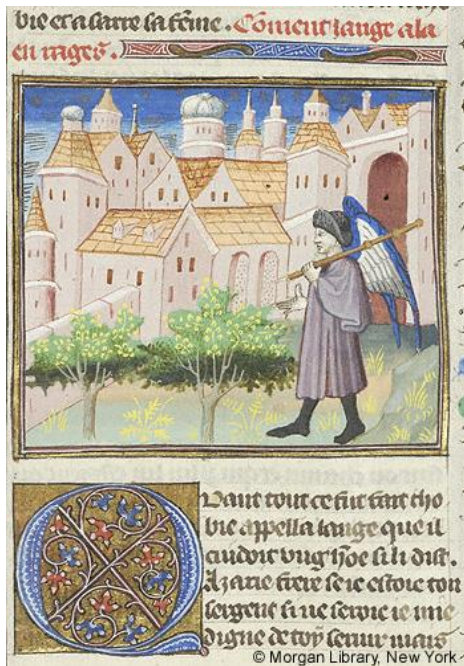
Fig. 22. Miniature showing the angel Raphael on his way to reclaim the money of Tobit (189r), c. 1415. Paint and ink on vellum, 444 x 352 mm (Full page). New York, Pierpont Morgan Library, MS. M. 394.