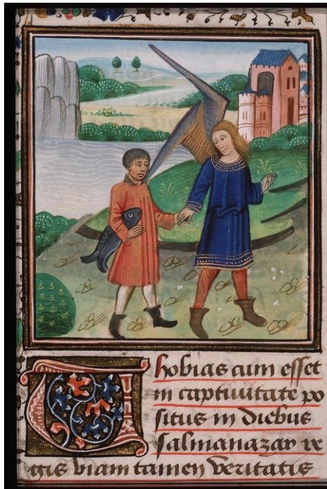
Fig. 12. Part of a manuscript folio depicting Tobias and the angel on their way (f. 74v), c. 1455. Paint and ink on vellum, 291 x 207 mm (Full page). The Hague, Koninklijke Bibliotheek, 76 E 7. Available from: Medieval Illuminated Manuscripts, http://manuscripts.kb.nl/zoom/BYVANCKB%3Amimi_76e7%3A074v_min (accessed May 30, 2018).