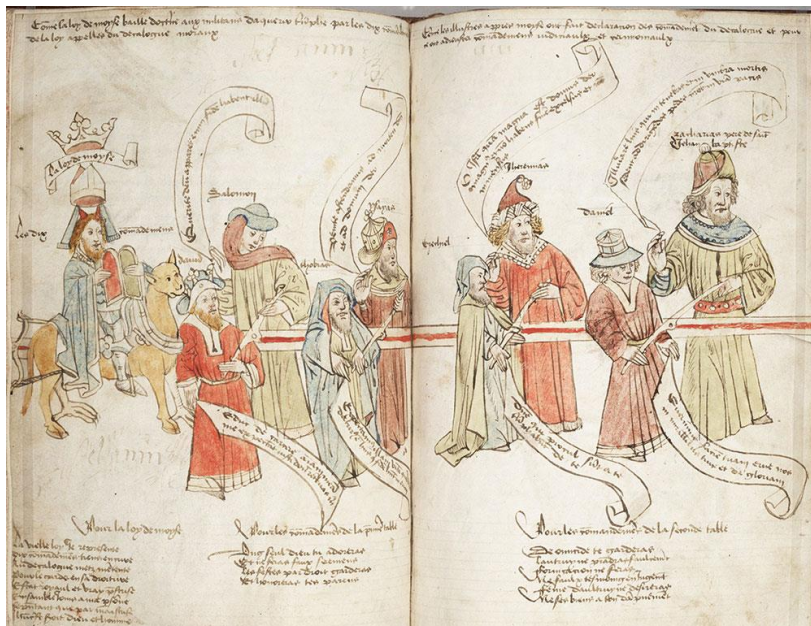
Fig. 38. Miniature illustrating the Law of Moses (ff. 106v-107r), 1475. Paint and ink on parchment, 282 mm x 414 mm (Each page). Philadelphia, Free Library of Philadelphia, MS Lewis E 210. Available from: Digital Collections Free Library of Philadelphia, https://libwww.freelibrary.org/digital/item/3780 (accessed May 30, 2018).