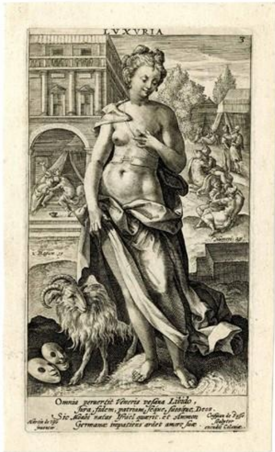
Fig. 49. Crispijn de Passe the Elder after Maarten de Vos, Luxuria , c. 1590-1637. Engraving, 159 x 87 mm. London, The British Museum, Inv.-Nr. D,6.67. Available from: The British Museum,

http://www.britishmuseum.org/research/collection_online/collection_object_details.aspx?objectId=1557049&partId=1 .