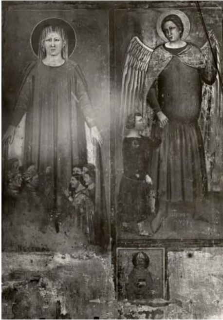
Fig. 4. Madonna della Misericordia (Madonna of the protecting coat) and Raphael and Tobias , c. 1350. Fresco, dimensions unknown. Verona, basilica of San Zeno. Available from: Federico Zeri Foundation, http://catalogo.fondazionezeri.unibo.it/scheda.v2.jsp?decorator=layout_resp&apply=true&locale=en&tipo_scheda=OA&id=6395&titolo=Anonimo%20veronese%20sec.%20XIV%20%09%09%09%20%09%09%20%20%20%20%20,%20Madonna%20della%20Misericordia%20;%20Tobia%20e%20san%20Raffaele%20Arcangelo (accessed May 30, 2018).