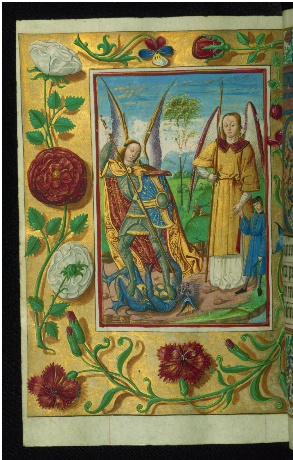
Fig. 37. Folio with a miniature depicting Saint Michael slaying the devil and Tobias and the angel, with a decorated border (f. 260v), c. 1510. Paint and ink on parchment, 189 x 129 mm. Baltimore, The Walters Art Museum, W.420.