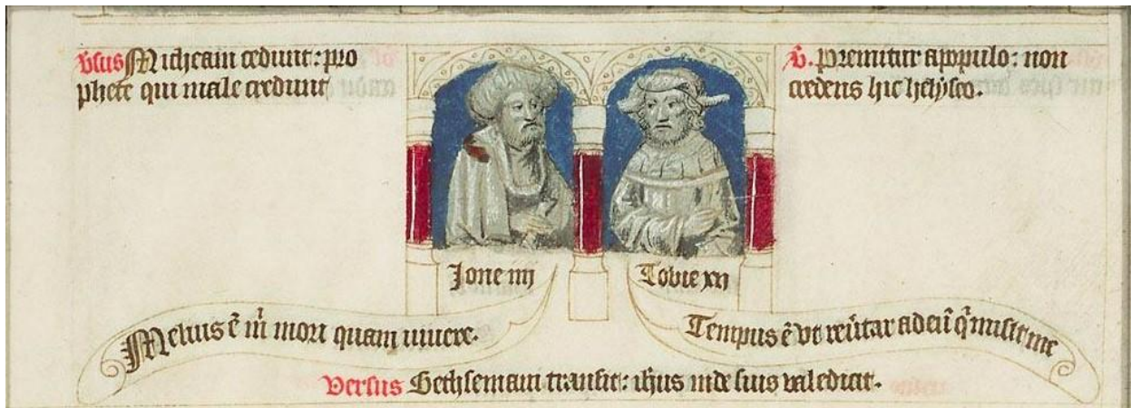
Fig. 7. Detail of a miniature depicting Jonah and Tobit (f. 29r), c. 1470. Paint and ink on vellum, 262 x 190 mm (Full page). The Hague, RMMW 10 A 15. Available from: Medieval Illuminated Manuscripts, http://manuscripts.kb.nl/zoom/BYVANCKB%3Amimi_mmw_10a15%3A029r_5 (accessed May 30, 2018).