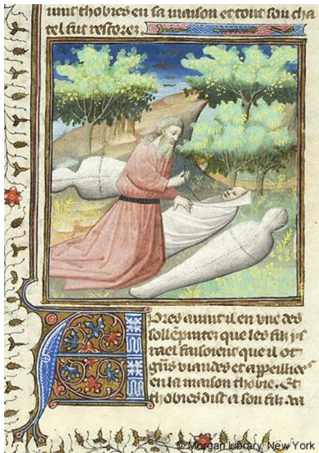
Fig. 24. Miniature depicting Tobit burying the death (f. 1r), c. 1415. Paint and ink on vellum, 444 x 330 mm (Full page). New York, The Pierpont Morgan Library, MS M. 395. Available from: The Morgan Library and Museum, http://ica.themorgan.org/manuscript/page/1/110798 (accessed May 30, 2018).