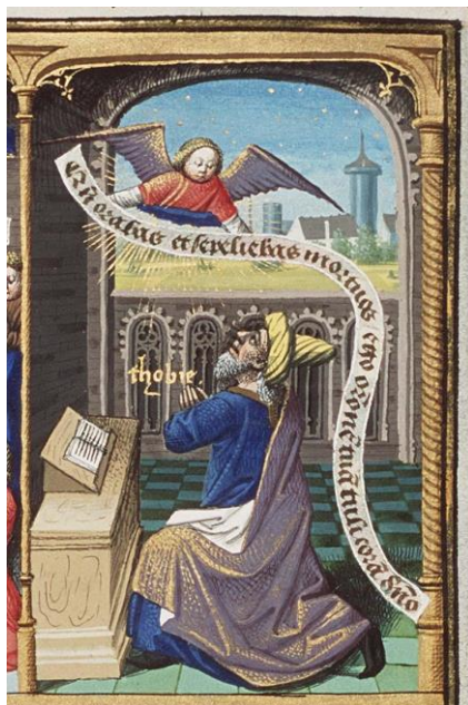
Fig. 39. Miniature depicting the praying Tobit , c. 1475. Paint and ink on vellum, 440 x 300 mm (Full Page). The Hague, RMMW, 10 A 11. Available from: Medieval Illuminated Manuscripts, http://manuscripts.kb.nl/zoom/BYVANCKB%3Amimi_mmw_10a11%3A018r_min_2 (accessed May 30, 2018).