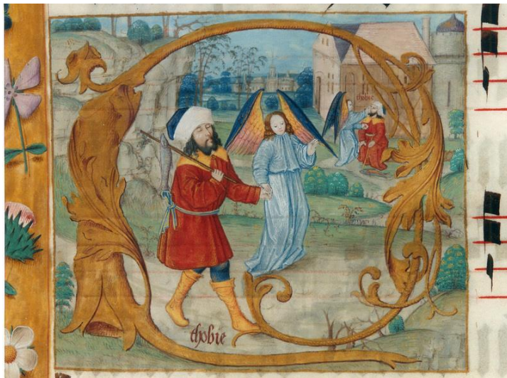
Fig. 34. Miniature depicting Tobias and the angel Raphael and Raphael healing Tobit's eyes , c. 1500. Paint and ink and parchment, 600 x 400 mm (Full page). Westmalle, Abdij O.-L.-Vrouw van het H. Hart, Obj.-Nr. 87314.