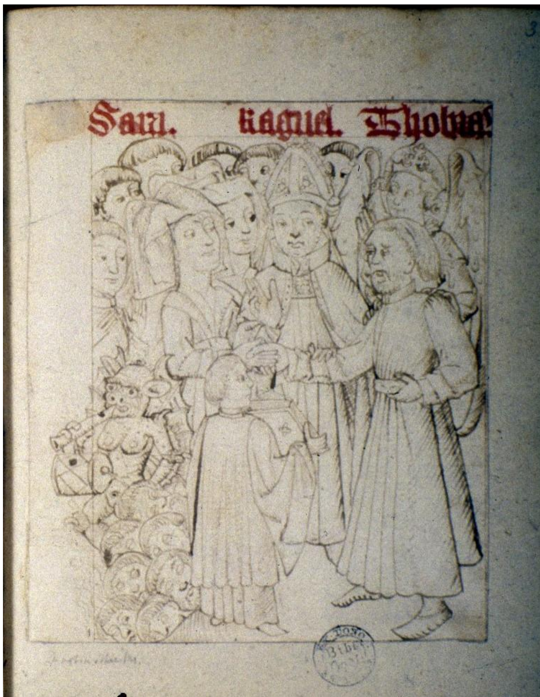
Fig. 10. Manuscript folio depicting the marriage of Sarah and Tobias (f. 3r), c. 1460. Ink on paper, 170 x 135 mm. Oxford, Bodleian Library, MS. Douce f. 4. Available from: Luna, http://bodley30.bodleian.ox.ac.uk:8180/luna/servlet/detail/ODLodl~1~1~3035~103100:Speculum-humanae-salvationis--fragm?sort=Shelfmark%2CFolio_Page%2CRoll_%23%2CFrame_%23&qvq=q:tobit;sort:Shelfmark%2CFolio_Page%2CRoll_%23%2CFrame_%23;lc:ODLodl~1~1&mi=11&trs=14# (accessed May 30, 2018).