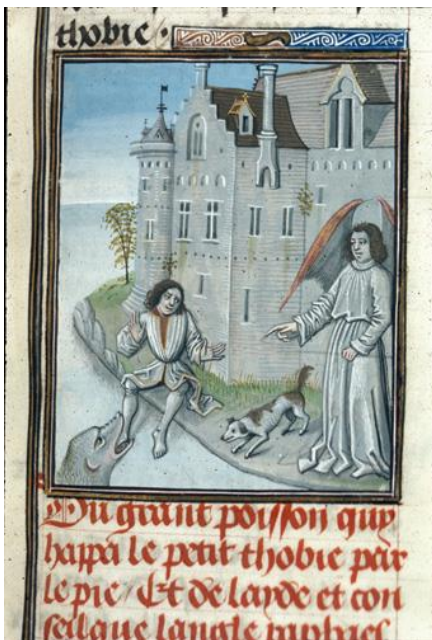
Fig. 21. Miniature depicting Tobias' foot getting swallowed (f. 23r), c. 1475. Paint and ink on parchment, 435 x 320 mm (Full page). London, The British Library, Royal 15 D I.