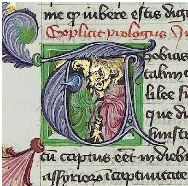
Fig. 17. Historiated initial with the tribe members of Tobit worshipping the golden calf of king Jerobaom (f. 184r), c. 1400. Paint and ink on parchment, 430 x 310 mm (Full page). Vatican, Biblioteca Apostolica Vaticana, Pal. Lat. 1.