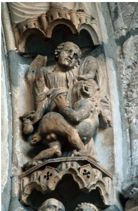
Fig. 3. Sculpture of the angel Raphael capturing Asmodeus, c. 1194-1230. Stone, dimensions unknown. Chartres, outer archivolt on the right portal of the north porch of the Cathedral of the Notre-Dame.