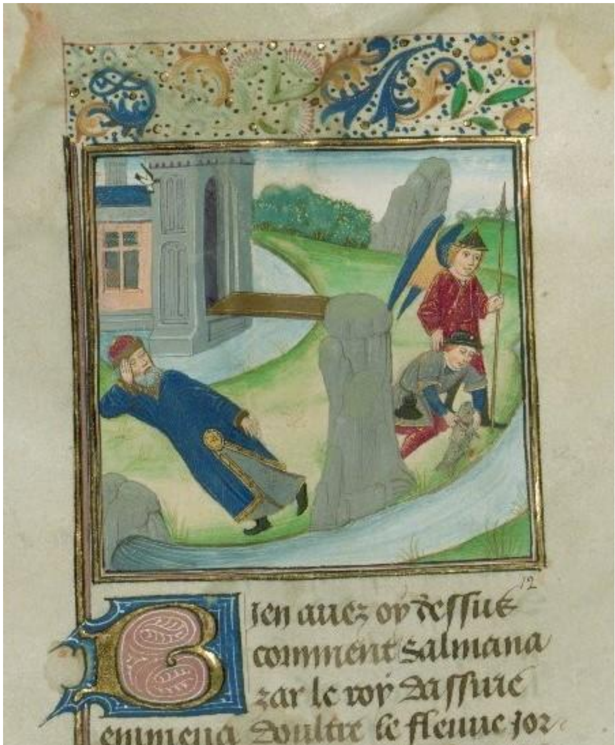
Fig. 42. Miniature depicting the blinding of Tobit and the angel Raphael and Tobias catching the fish (f. 96v), c. 1470. Paint and ink on parchment, 314 x 437 mm (Full page). Baltimore, Walters Art Museum, MS. 307.