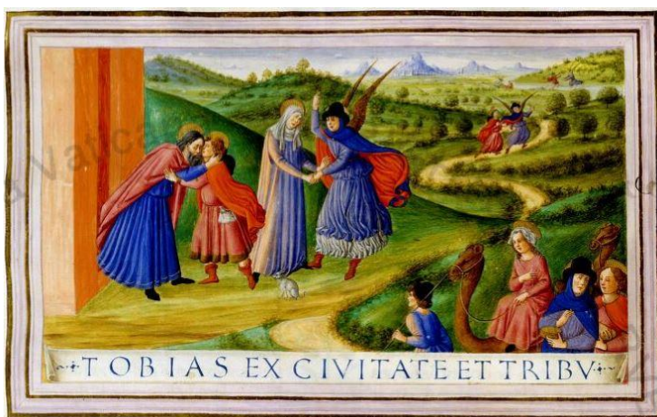
Fig. 19. Miniature depicting several episodes of the story of Tobit (213v), 1477. Paint on parchment, 598 x 441 mm (Full page). Vatican, Biblioteca Apostolica Vaticana, Urb. Lat. 1. Available from: Digital Vatican Library, https://digi.vatlib.it/view/MSS_Urb.lat.1 (accessed May 30, 2018).