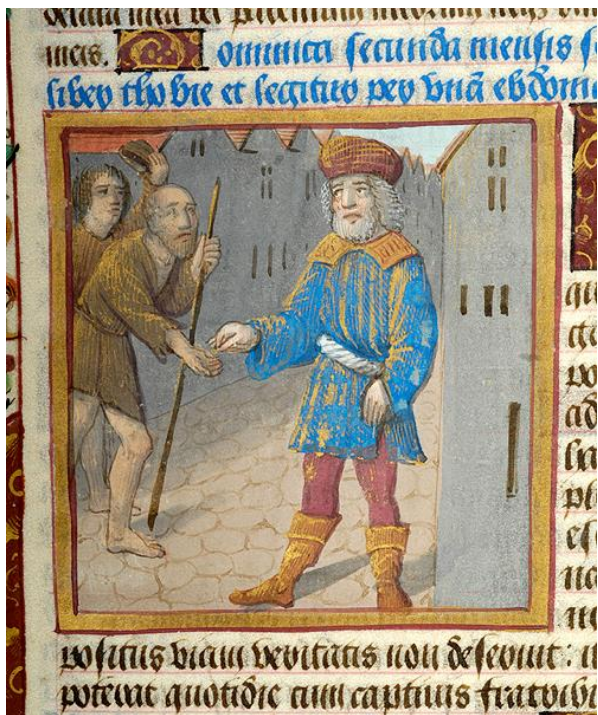
Fig. 33. Miniature showing Tobit in captivity (f. 167), c. 1511. Paint and ink on vellum, 219 x 152 mm (Full page). New York, The Pierpont Morgan Library, MS M. 8. Available from: The Morgan Library and Museum, http://ica.themorgan.org/manuscript/page/71/76862 (accessed May 30, 2018).