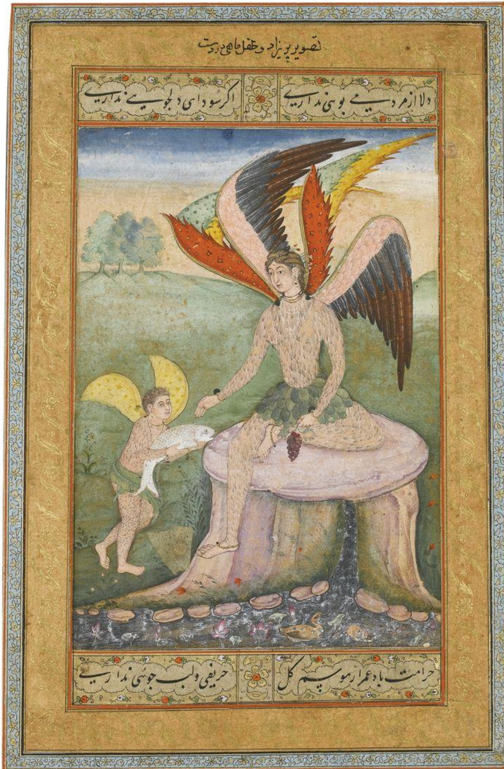
Fig. 45. Manohar, Tobias and a seated angel , c. 1590. Gouache heightened with gold on paper, 147 x 104 mm (Painting). Provenance unknown. Available from: Sotheby's, http://www.sothebys.com/en/auctions/ecatalogue/2015/sven-gahlin-collection-115224/lot.10.html (accessed May 30, 2018).