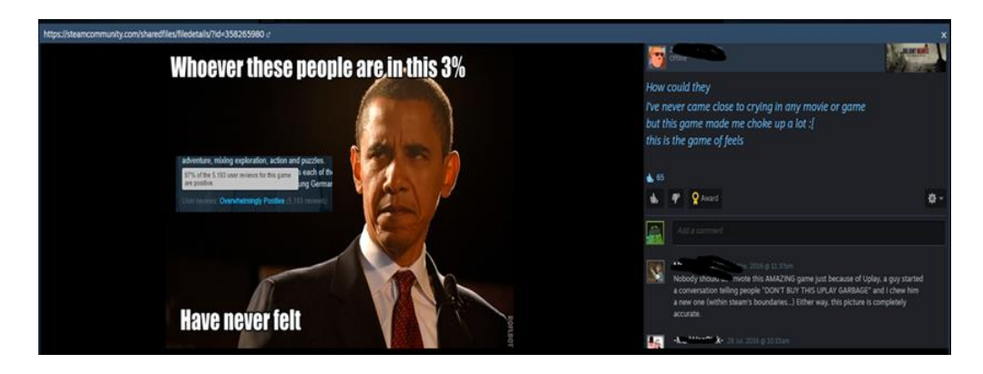
Meme critiquing the 3 percent of players that have rated the game "negative" on Steam (Appendix C, Figure 49)

This emotional journey is triggered through telling the tale of a varied cast of characters that you play as and manages to give the war a "human face". Valiant Hearts does this not with a focus on the allied side of the war, but includes many different identities, such as a nurse, a German soldier, and even a dog. This really arouses the idea that everyone is a victim of the war and that there is no "good" or "bad", which we generally see in conventional military/war games. Valiant Hearts deconstructs this binary and exposes the true antagonist of the game: the war itself. As one player excellently explains: