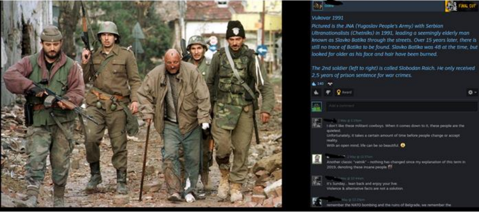
Pictures of real-life wars (predominantly from the Yugoslavian wars are often shared in the community section of TWoM (Appendix A, Figure 52, 54, 55).

Similarly, de Smale (2020) shows, through her excellent research, how in the comment section of YouTube videos concerning TWoM, connecting but also colliding memories appear from people discussing the Yugoslavian wars. For example, she shows how people share childhood and family memories of the war, with the overarching content crossing themes such as feelings of loss, displacement and insecurity. Some even explain how they are hesitant to play the game because of the memories it triggers (de Smale, 2020). de Smale (2020) explains: "because playing these games can potentially offer embodied experiences of the past – as seen in historical re-enactments – it is not difficult to imagine why some players are hesitant" (p. 198).