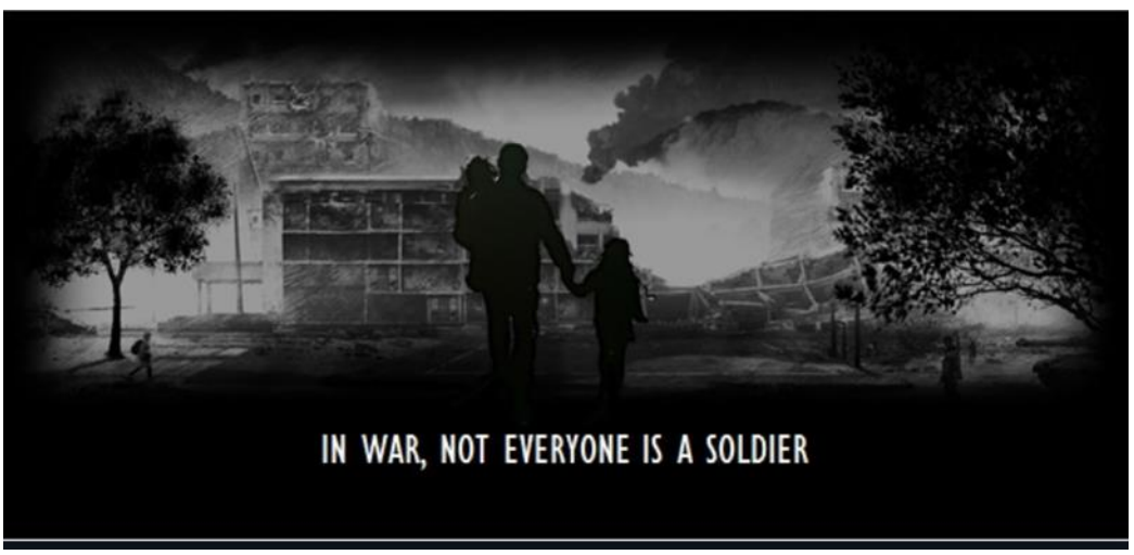
Artwork with the marketing slogan (Appendix A, Figure 53).

The main marketing slogan underscores the centrality of the civilians: "In war, not everyone is a soldier". This central, promotional message is re-purposed and re-used in various community artwork, exhibiting the significance of the main protagonists.