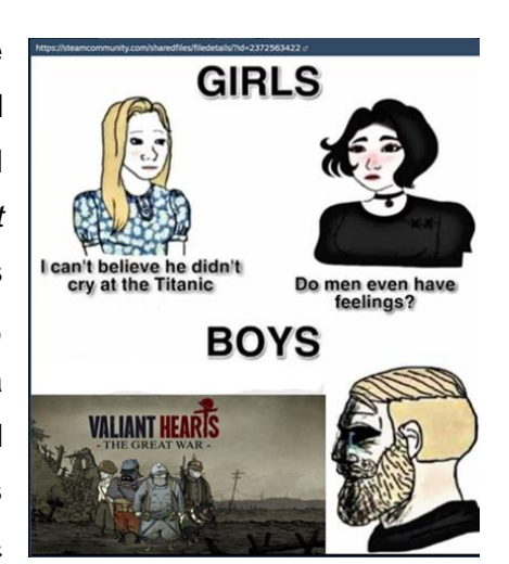
Meme about the emotional nature of the game (Appendix C, Figure 51).

From the onset, it is clear that the emphasis of the game lies on the characters and their emotional journey. Unlike Spec Ops and TWoM, that both trigger the inner discomfort, complicity and depressing feelings because of the horrors of war, I felt that Valiant Hearts was more centered around empathy and compassion with its main cast. There is no horror, shock-value or disturbances. Instead, emotions are triggered because of its story and its ability to give a human face to the conflict. This is also widely acknowledged and appreciated by the players themselves. One player notes: "If tears pool after finishing this game it means that you are mature & compassionate. One of the most beautiful stories out there. Only for Valiant Hearts!" (Appendix C, Figure 18).