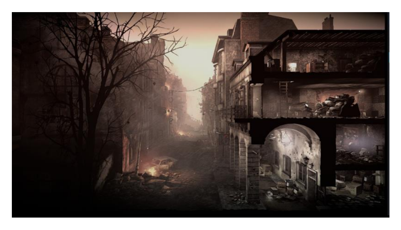
Screenshot from the game, showing the desolated landscape. The graphics look like an oil painting, with dull colors, excellently supplementing the depressing tone of the game.

Various reviews and comments made by players stress the negative emotional nature of the game. One player started a thread on the subreddit of the game to ask how other players dealt with these depressing feelings: