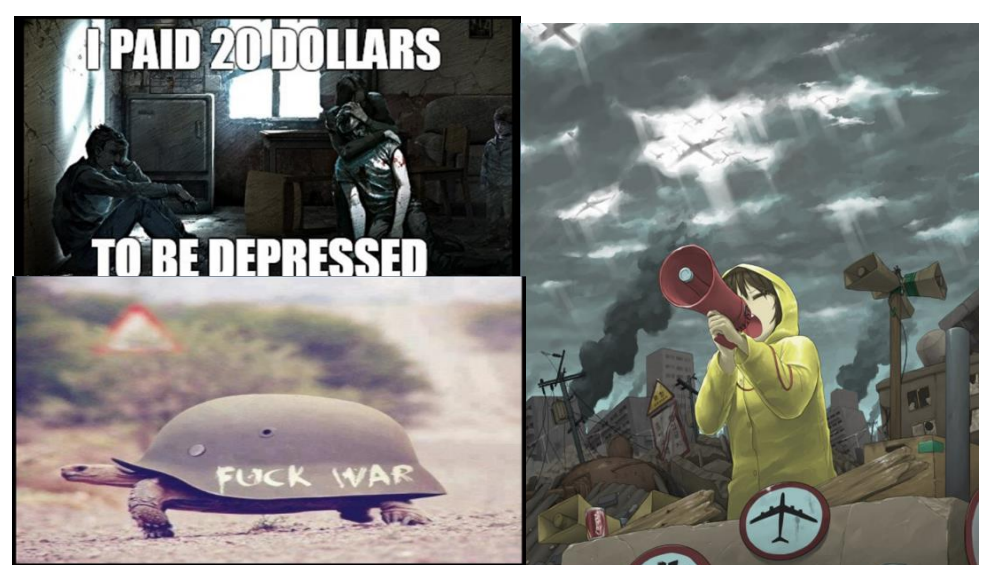
Various memes, artwork, etc. (Appendix A Figure 50, 65, 66)

Many other players replied and shared their experiences and coping mechanisms. Scrolling further on the subreddit revealed similar questions and threads of people discussion these negative emotions and how to cope with them. A lot of artwork, screenshots and other visual creations reaffirms those emotional feelings that the game evokes.