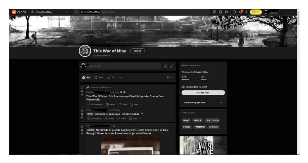
An example of a "sub-reddit" dedicated to This War of Mine.

Reddit is a similar platform, but consist only out of "subreddits" or community pages. Important is the fact that Reddit is not solely dedicated to gaming culture. There are many other non-gaming related "subreddits" from political communities to DIY ones. Here, I focused on the dedicated gaming communities of the games I took as case-studies. Contrary to Steam , there are no dedicated sections for artwork or discussions. Everything appears on the main-page based on a community rating system.