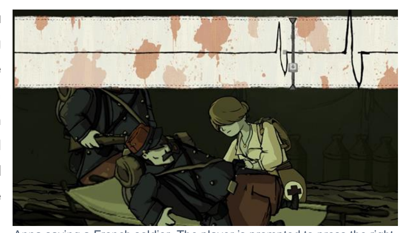
being a nurse, lets you treat these wounded Anna saving a French soldier. The player is prompted to press the right buttons at the exact time it appears on screen. [personal screenshot].

Instead of engaging yourself in violence, you are often doing the opposite: saving or helping people. An excellent in-game example illustrating this, is the story of Anna, a Belgian nurse. Particularly, I remember playing through one section where I arrived at the battlefield with Anna, encountering numerous bodies and graves scattering the landscape. Some soldiers, were still alive, crying for help. Anna, being a nurse, lets you treat these wounded soldiers. Through "quick time events" (QTE's),