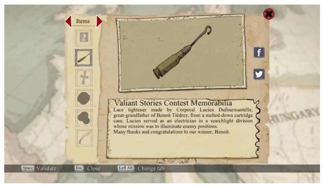
Lace tightener that can be found in the game as collectible. This item was included because of a social media contest, thus showing the close connection between the developers and the player base. [personal screenshot]

I found the item collecting process quite enjoyable, especially because they were interesting to read. One particular item stood out to me: a lace tightener made from a bullet. Not necessarily the item itself stood out to me, but the fact that I later learned, that this item was included in the game, because of a social media contest. This item does not only show the relevance of so-called trenchart, which was a viable past-time for many soldiers during the war, but also shows the close relation between the developers and some of its players.