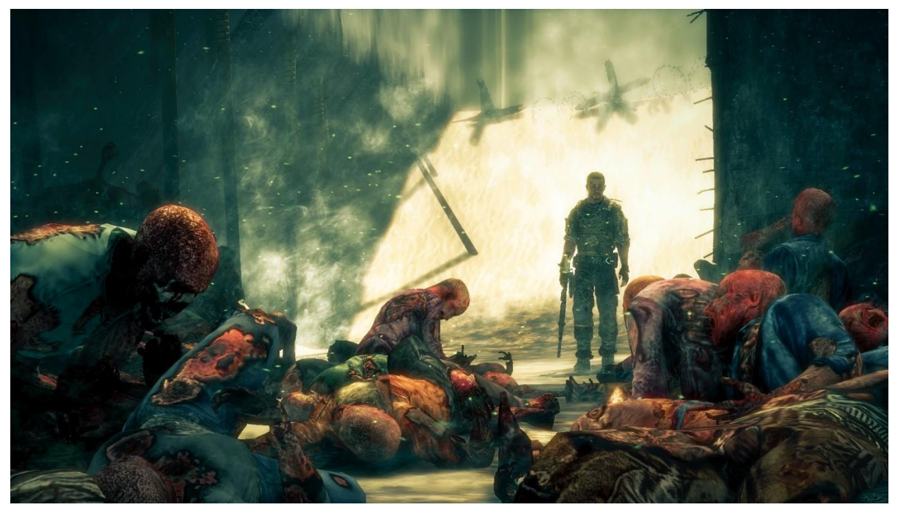
The moment when Walker (and the player) realize that he killed many civilians in the process. [personal screenshot]

further, you discover that the 33<sup>rd</sup> were transporting refugees that you killed in the process. At that moment the camera zooms in at Walker's face and you clearly see his distress.